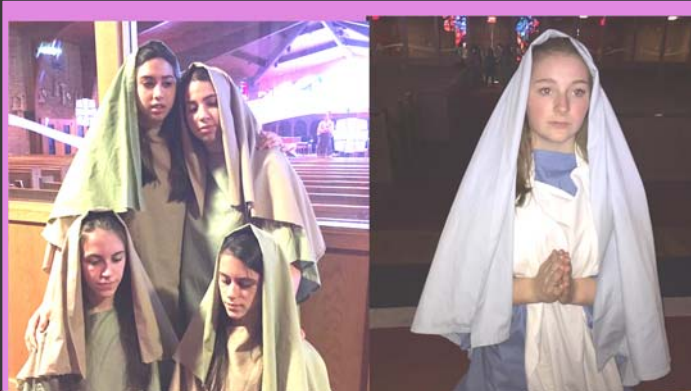
Some faces from Stations