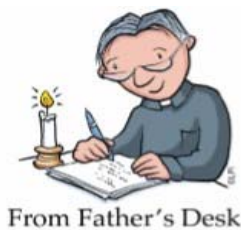
From Father's Desk