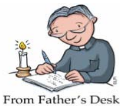
From Father's Desk