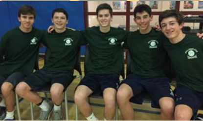
Full Court for Kindness 2018

“May we remember to spread love, inclusion, sportsmanship and tolerance in our community.”