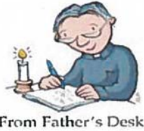
From Father's Desk

Triduum means "three days," usually referring to Christ's resurrection from the dead "on the third day." The Easter Triduum refers to the three days beginning with sundown on Holy Thursday and ending with evening prayer on Easter Sunday. Reckoning days from sundown to sundown is still evident in both Jewish and Christian practice.