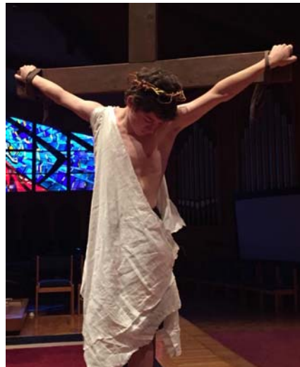
“Good Friday’s Living Stations was a beautiful, thoughtful prayer.”