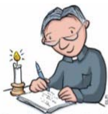
From Father's Desk