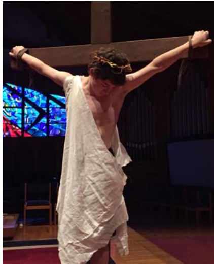
“Good Friday’s Living Stations was a beautiful, thoughtful prayer.”